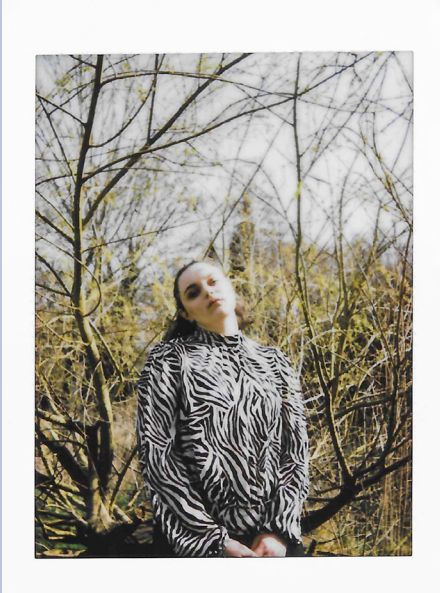
'Women wanting to be treated equally.'