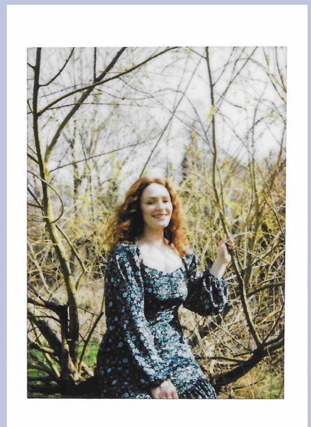
'Feminism to me means empowering women in every aspect in life through encouragement, through understanding every women's needs and supporting and cheering on one another.'