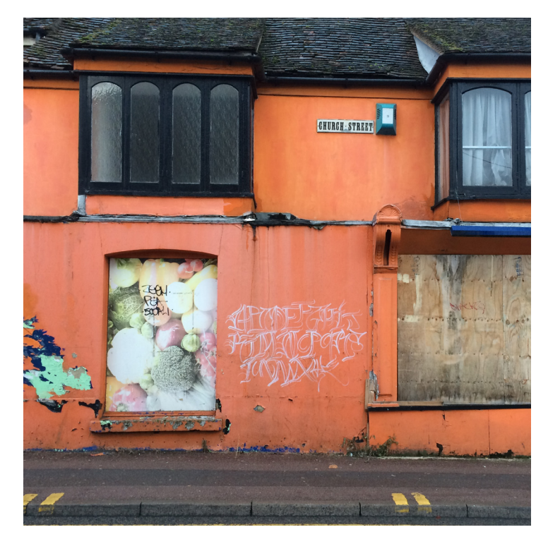
Your environment determines the way you interact with it.