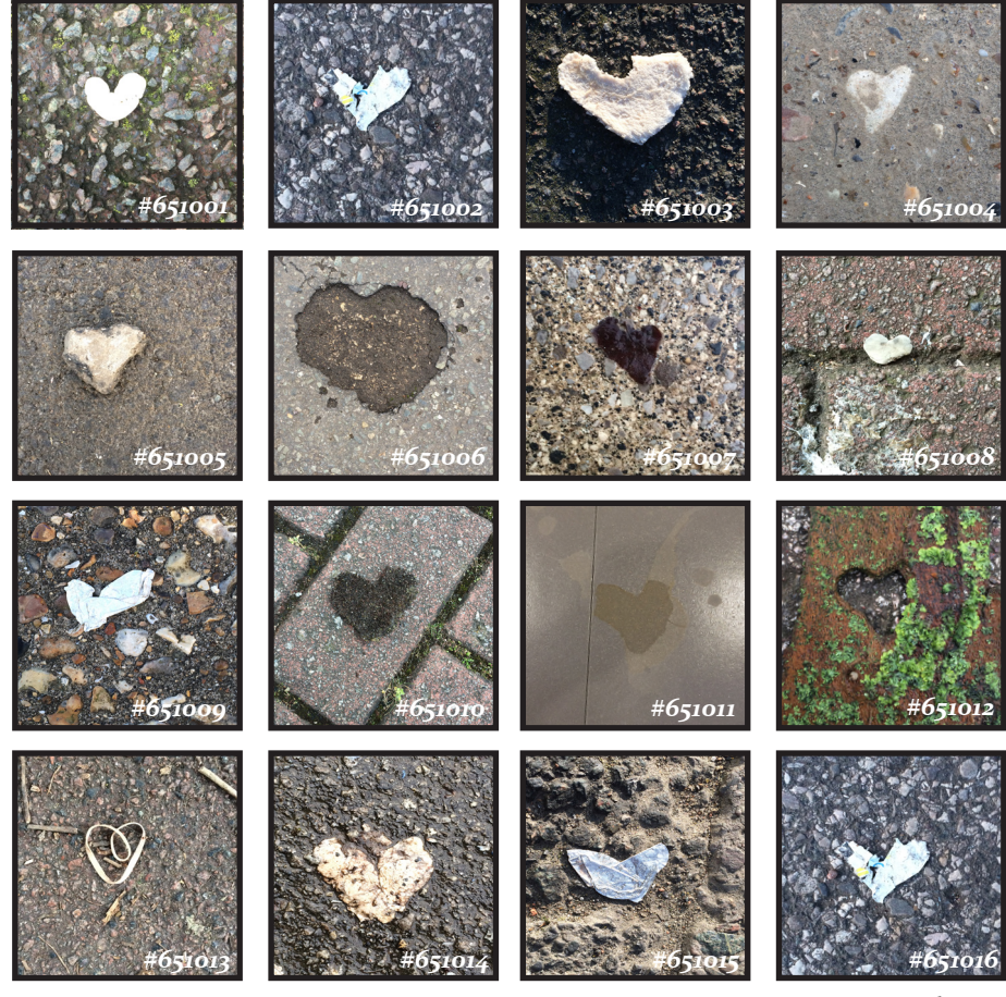
#651001 - #651016 hearts

one is treasure two is company three is a collection