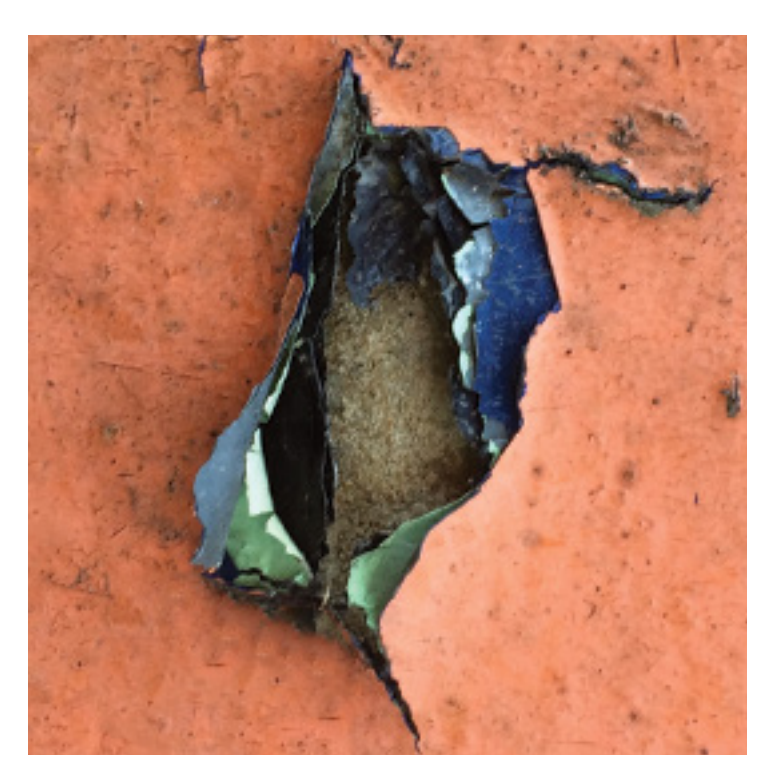
Looking beyond the immediate and the obvious frees up engrained thinking and enables a different and more personal interaction.