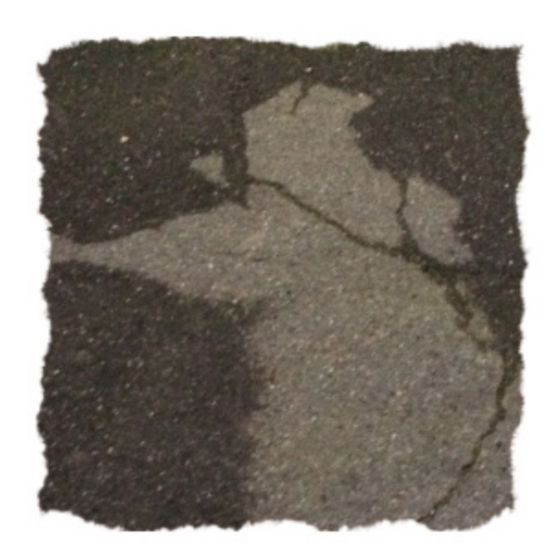
It is something, it is nothing, something about noticing and adapting, something about relationships and poetry...