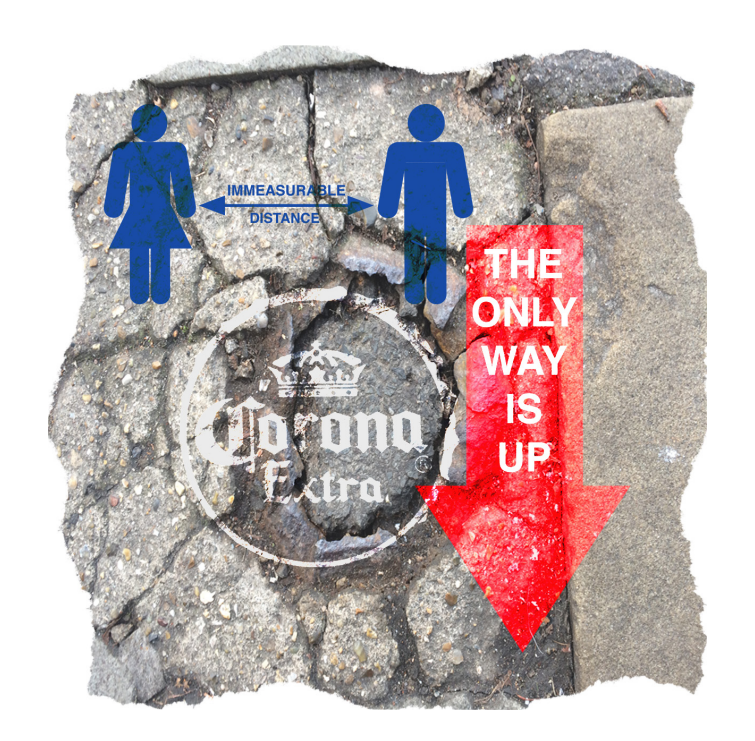
Brand association pushed sales of Corona Beer and discarded bottle tops up by 40%. Really.

Unfamiliar familiar. People returned, they needed structure. Pavements wore conventions. New. Noisy. Directive. There to be followed. There to be ignored.