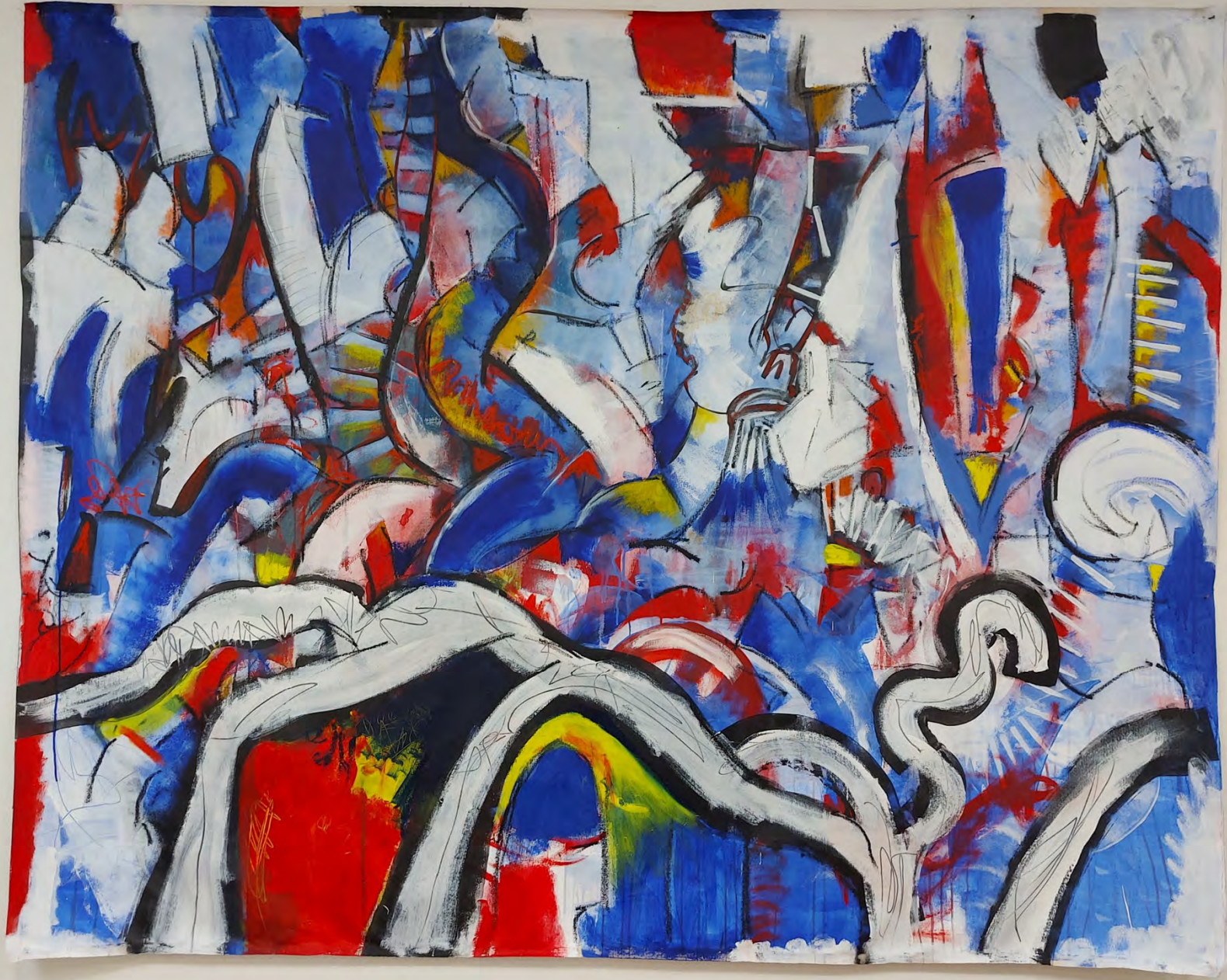
'Pompous Circumstance', 2022, 1.8 x 2.2 m, acrylic and oil pastel on canvas