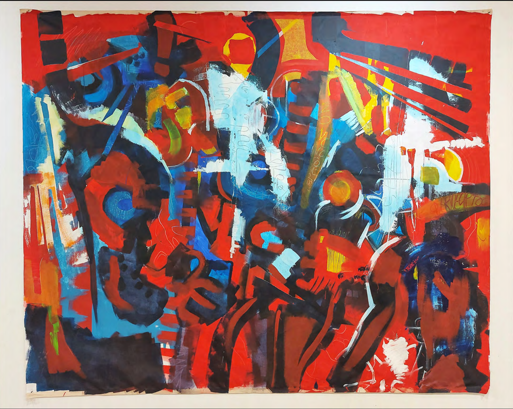
'G Force', 2021, 1.8 x 2.2 m, acrylic and oil pastel on canvas