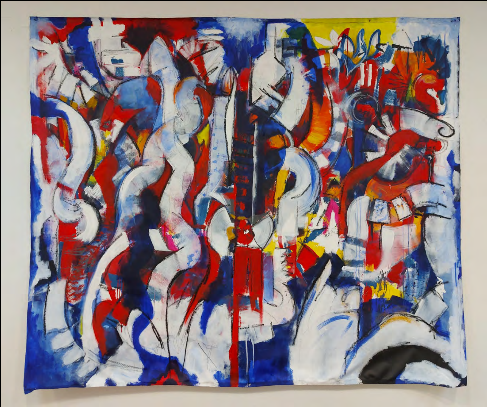
'Hullabaloo', 2022, 1.8 x 2.2 m, acrylic and oil pastel on canvas