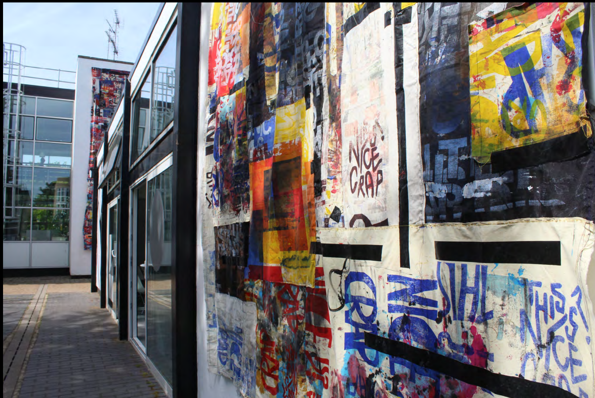
'Elephant', & IT is 'What IT IS', 2022 mixed media textiles as public art installation for UCA BA Fine Art Degree Show 2022