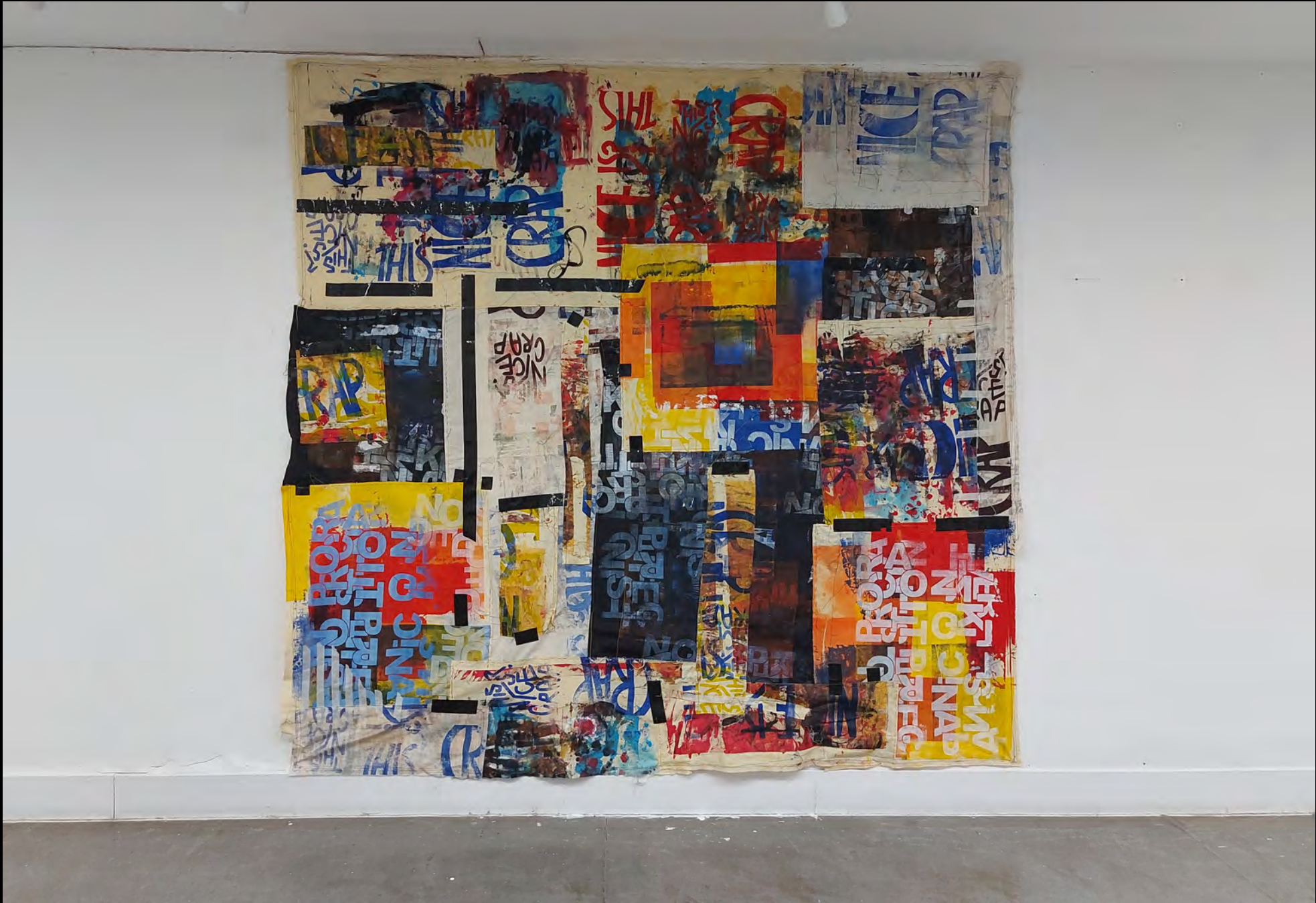
'IT Is What IT IS', 2022, 2.5 x 2.5 m, mixed media textile