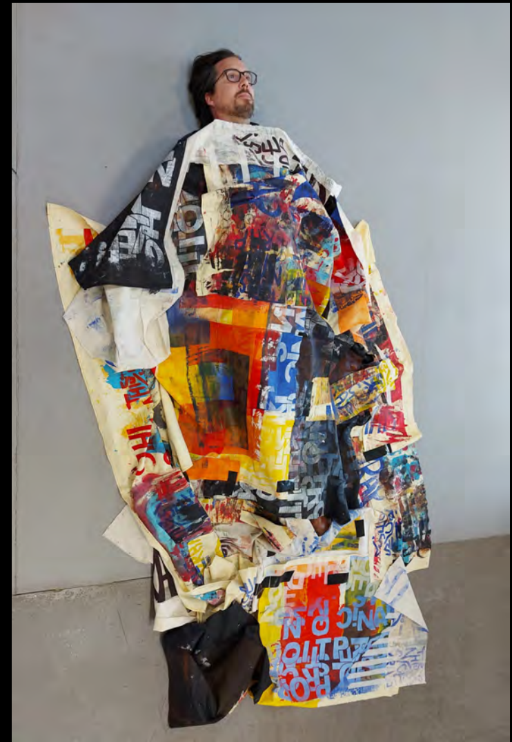
'IT Is What IT IS', 2022. As impromptu performance