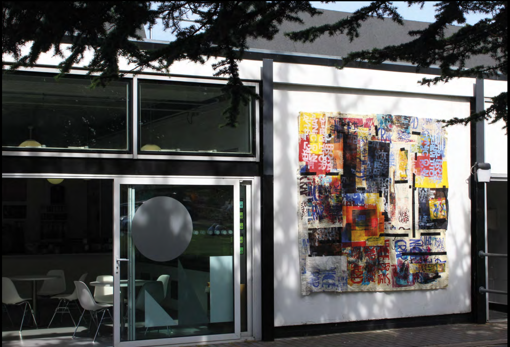
'IT Is What IT IS', 2022, 2.5 x 2.5 m, as public art installation for UCA Fine Art Degree Show 2022