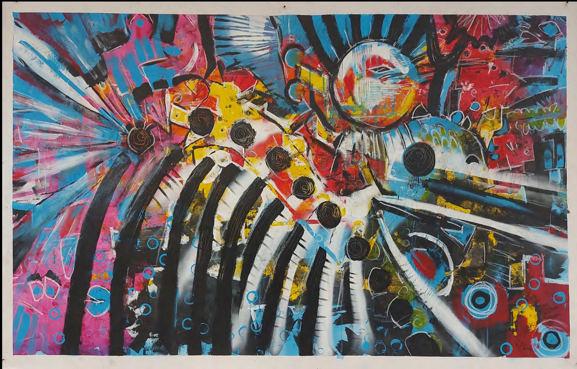
'Shifting Up A Gear', 2021, 1.2 x1.5m, acrylic and oil pastels on canvas