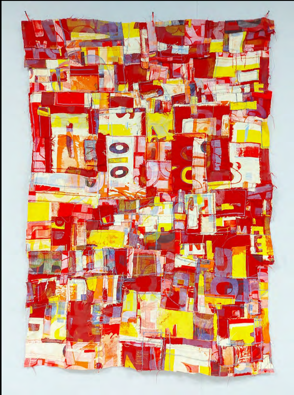
'Changing the Narrative' 2021 90 x 120 cm handprinted and appliquéd textile