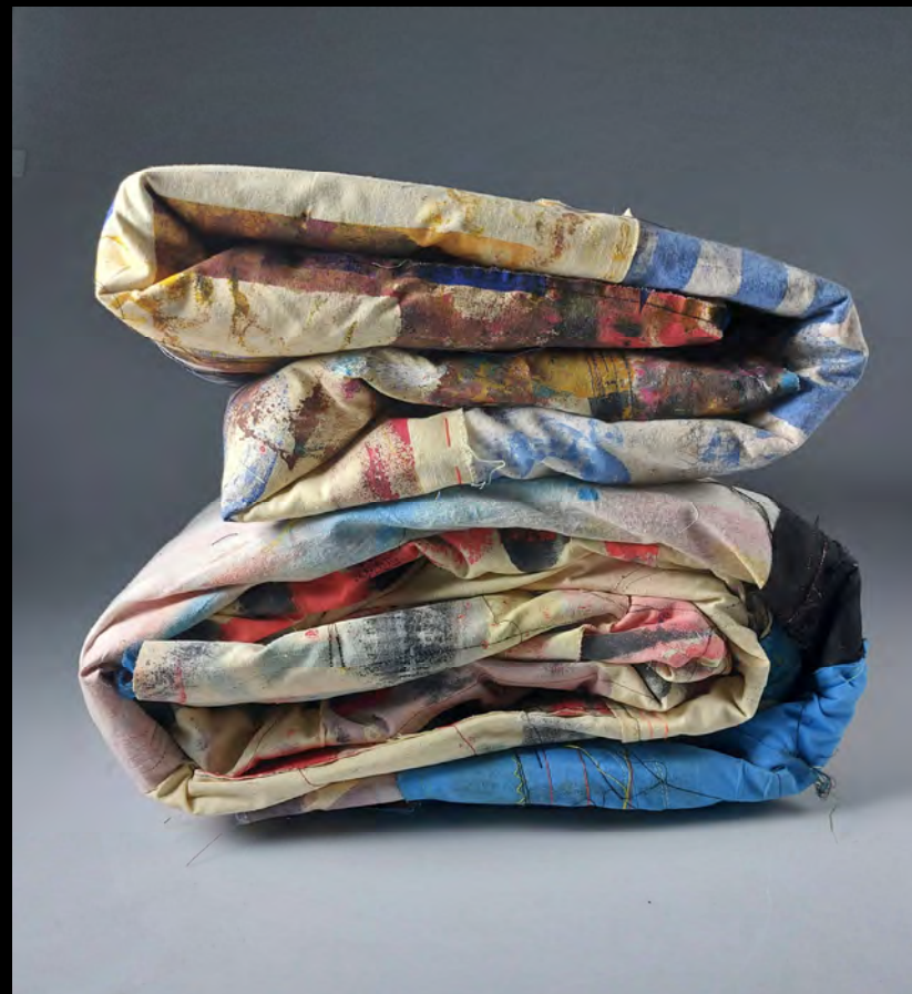
'Elephant' & 'IT Is What IT IS', 2022, 30 x 30 x 30 cm as mixed media textile as sculpture