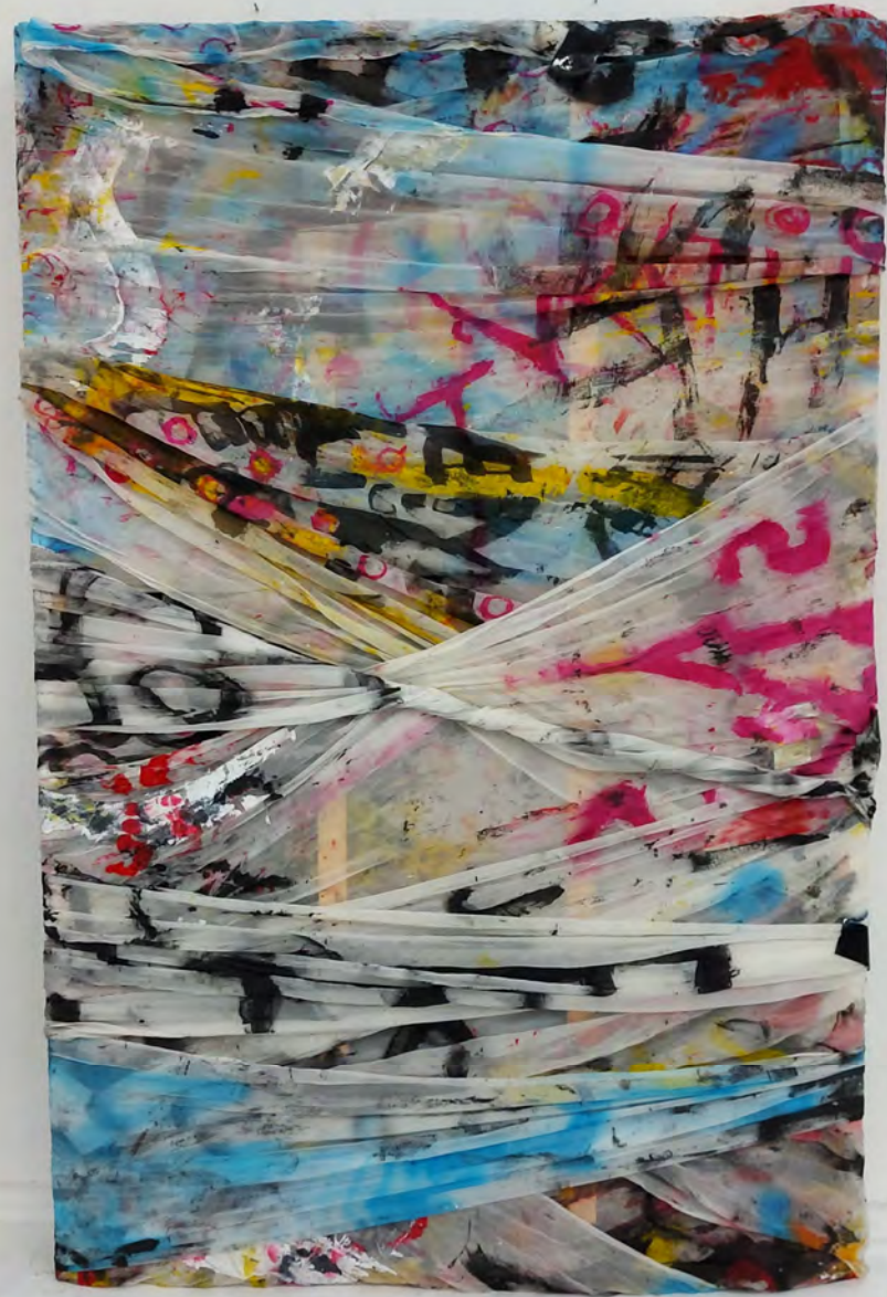
'Gallery Wrapped' 2021, 0.75 x 21m acrylic on chiffon wrapped around stretcher bars 1 x 1.5 m (view from both sides)