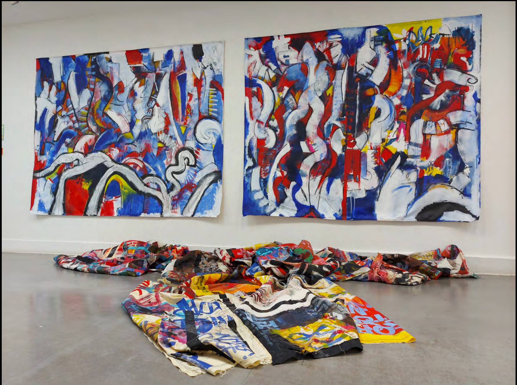
'Pompous Circumstance' & 'Hullabaloo', 2022, with textile work