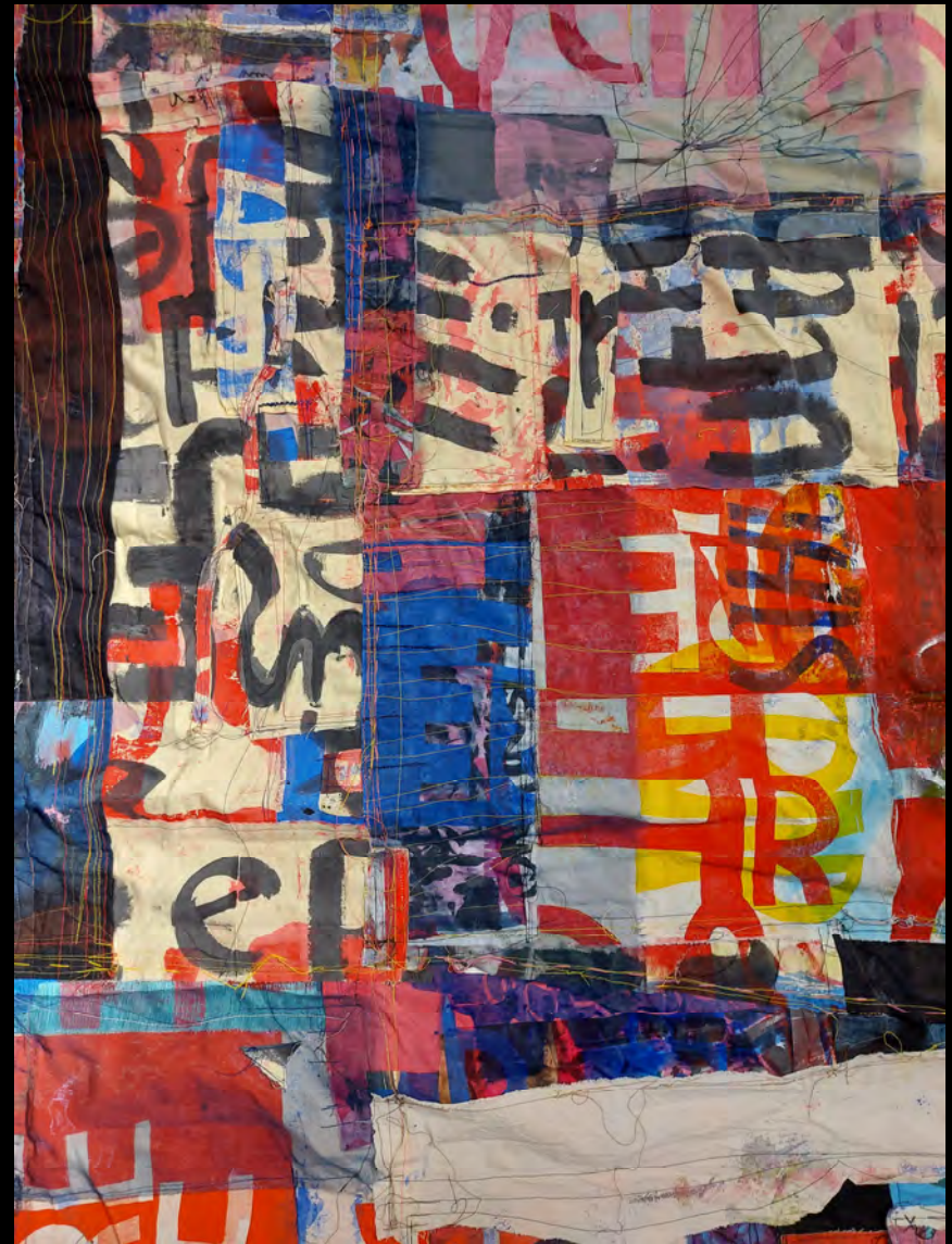
'Elephant', 2022, mixed media textile Close up views of small areas