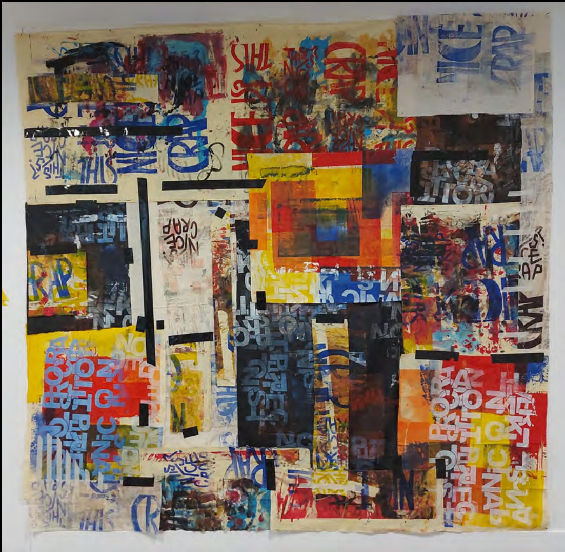
'IT Is What IT IS', 2022, 2.5 x 2.5 m, mixed media textile Installed in situ, wall based