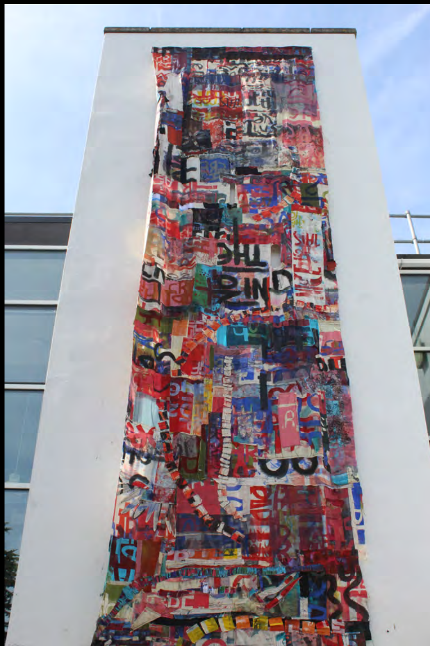
'Elephant', 2022, 6.5 x 1.5 m, mixed media textile as public art installation for UCA BA Fine Art Degree Show 2022