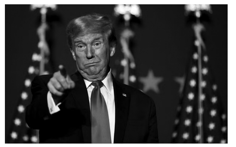
Donald Trump photographed at a presidential race debate.

Indeed, swift was so determinedly uncontroversial that she struck many as just a little bit bland. As Democrats try to stir her to arms, will she seize the opportunity of proving her detractors wrong?