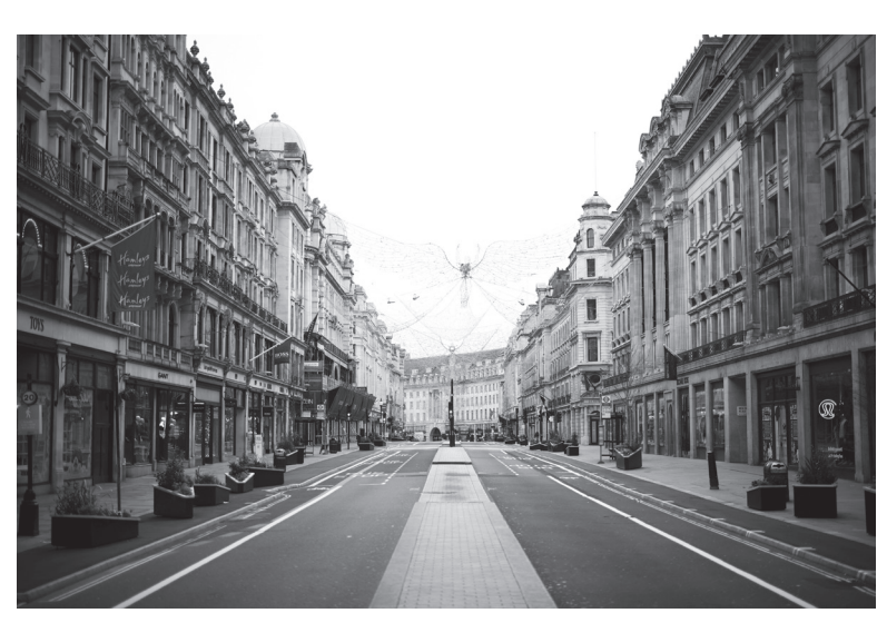
A look into what the streets of London look like empty.

Who would have thought the rain would ruin so much.eh?