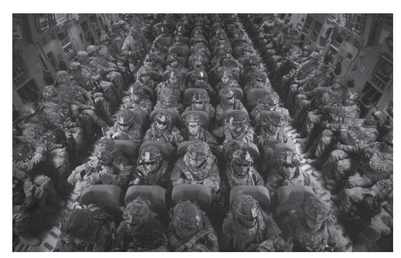
Soldiers on a flight after being deployed.

According to reports the Prime Minister's spokesperson said the British military has a proud tradition of being a voluntary force and there are no plans to change that. So you can all breathe a sigh of relief, there is no UK conscription before GTA 6.