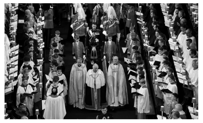
King Charles III arrives for the coronation ceremony.