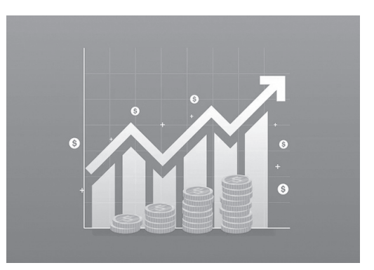
A graph showing an increase in money.

Earning 38k currently in Britain would put you in the top 30% of all earners with the average being only 33,000 there will be some slight exceptions to the rule, if you are under 18, if you're studying or if you have a disability, you will only have to earn 25,000 pounds to remain in the UK as Rishi Sunak says he wants to be compassionate with the rules.