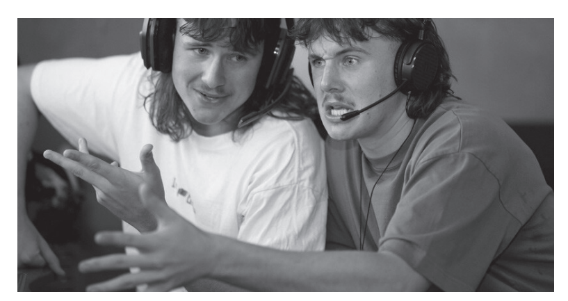
A photograph of the Shepmates.

I'm not the biggest fan. I am more of a NASCAR