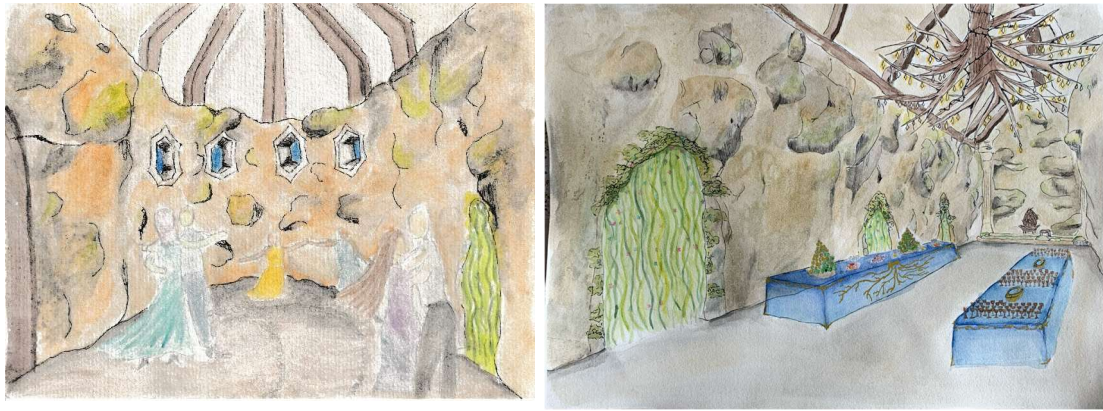
Great Hall and banquet tables