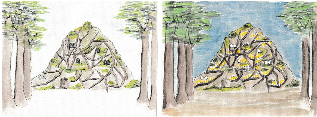
Outside night and day view