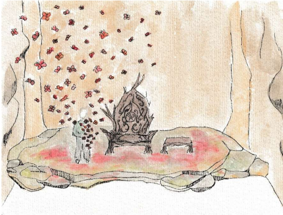
Death of the King