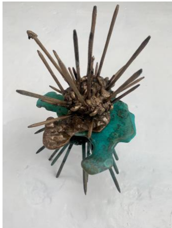
Reef Critter - Sandcast Bronze - 20cm x 27cm x 37cm (h)

The critter series examines the symbiotic relationship of animals in the ocean (such as the cleaner shrimp). The critter's strength lies in their co-dependence and mutual supportive. Their spines project aggression, but this is only to overcome their fear and anxiety and to protect their peaceful, gentle hearts.