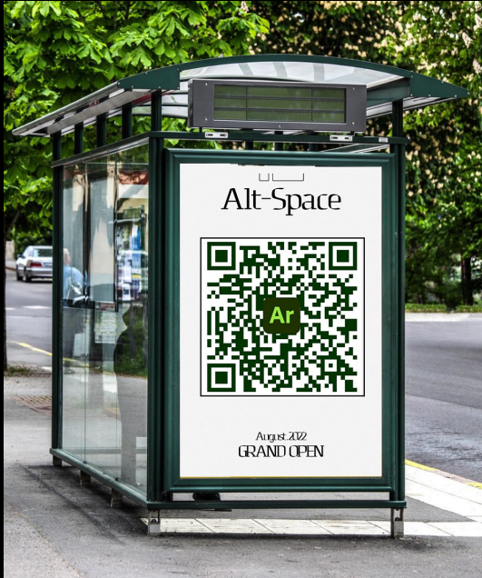
Bus Stop Ad Sample Image