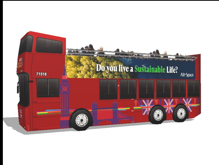
3D London Bus Output