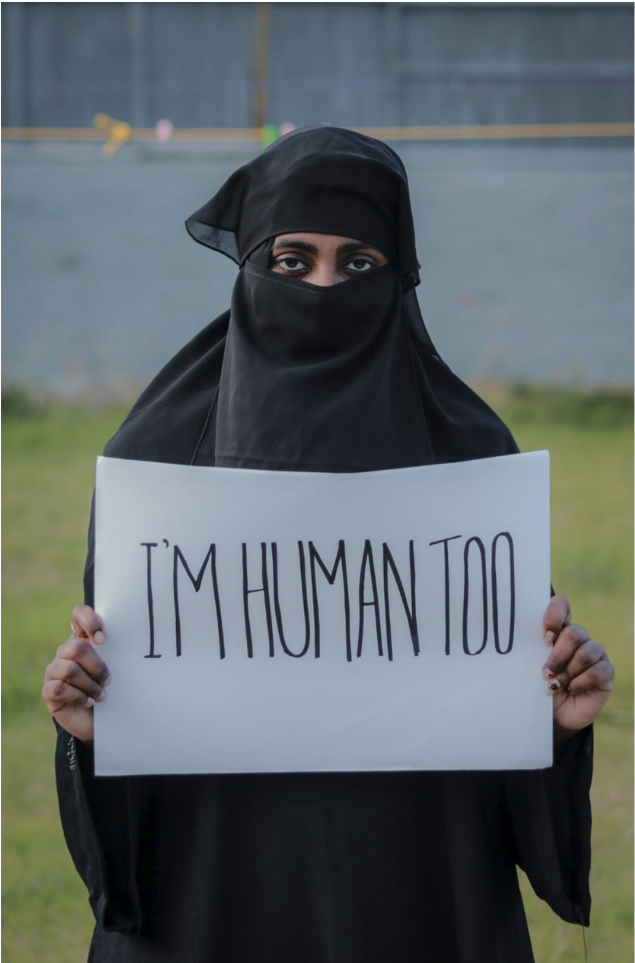
Size:a3 (297 x 420) Photograph