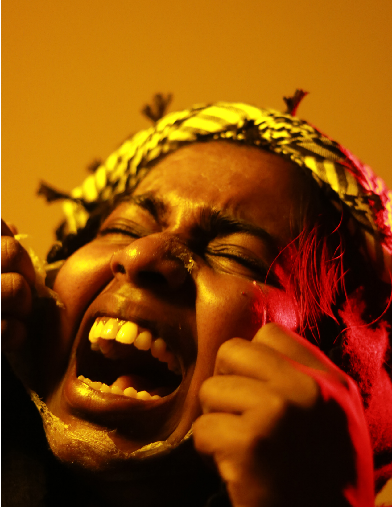
Size:a3 (297 x 420) Photograph

The healing power of commons lies in their ability to unite people and foster a sense of community. When individuals come together in shared spaces or collaborate on common projects, they forge strong connections that provide support and comfort. This collective bond helps people feel valued and reduces feelings of isolation, making it easier to navigate challenges and build resilience. By sharing experiences and offering mutual assistance, communities can heal and grow stronger, creating an environment where individuals thrive together and face adversity with renewed strength.