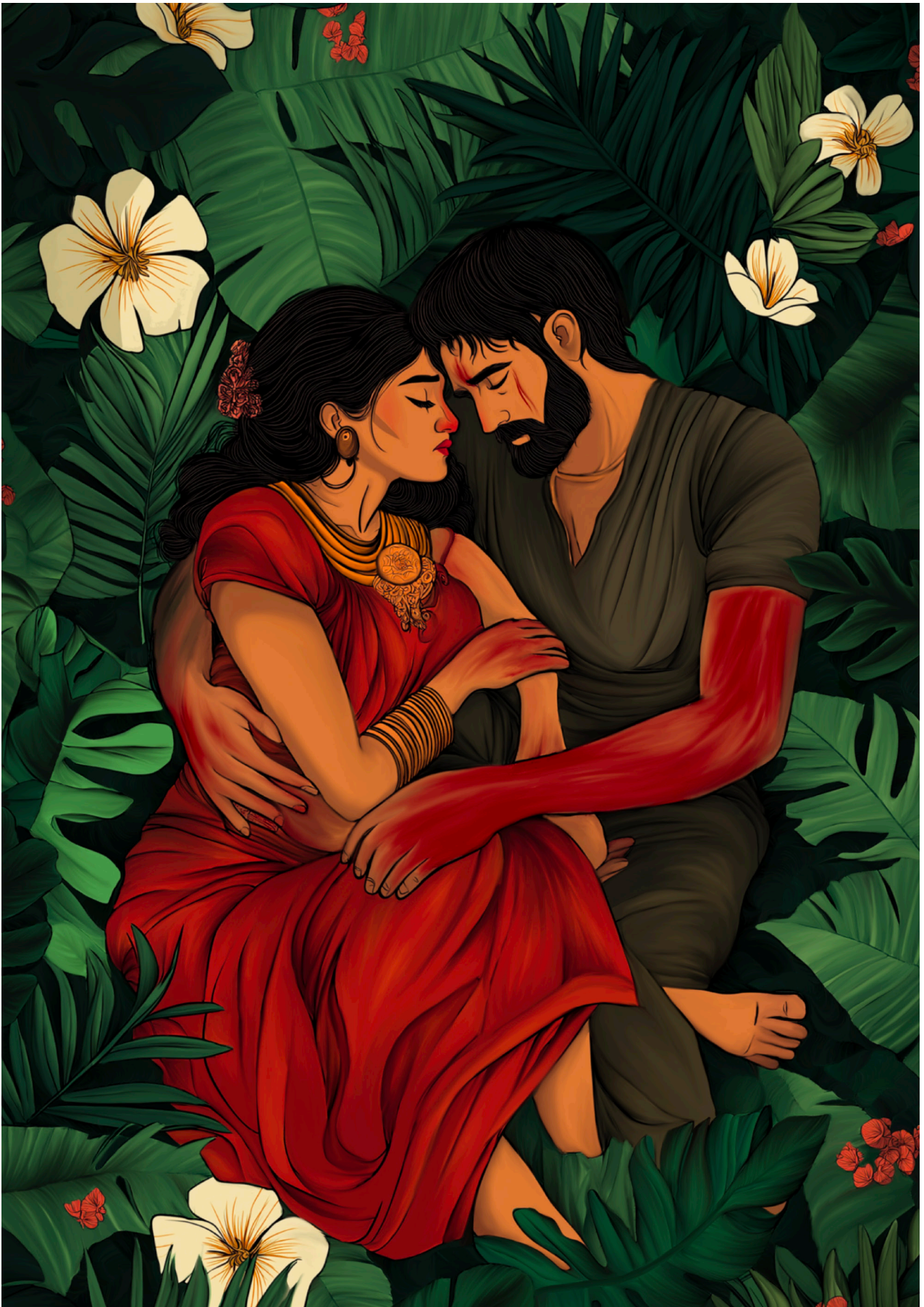
Bounded by love Size:a1 (594 x 841) Print on canvas