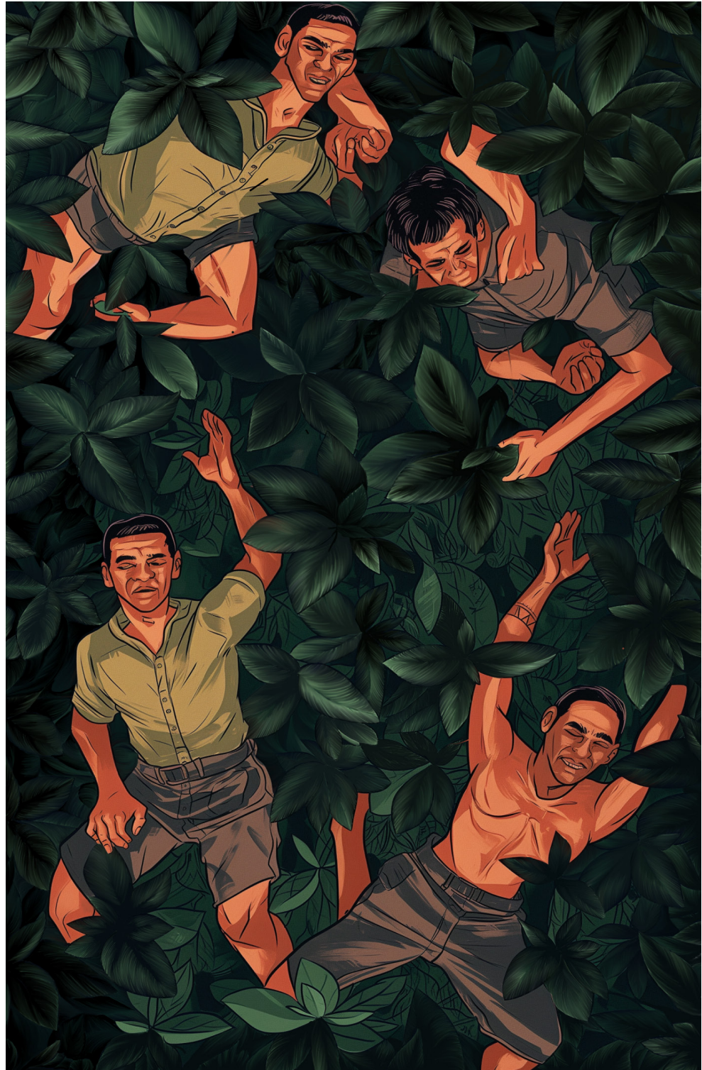
Fragile Power Size:a1 (594 x 841) Print on canvas

The artwork powerfully illustrates the weakness of common people under the grip of authority and dictatorship. Through its striking imagery and symbolism, the piece vividly captures the dominance and control exercised by figures of power. Bold contrasts and intense colors emphasize the oppressive nature of this control, creating a feeling of awe and anxiety. Symbolic elements like sharp angles and heavy shadows highlight the tension and fear experienced by ordinary people. The artwork invites viewers to reflect on how authority affects society and the complex dynamics of power, revealing the vulnerabilities and struggles of those subject to it.