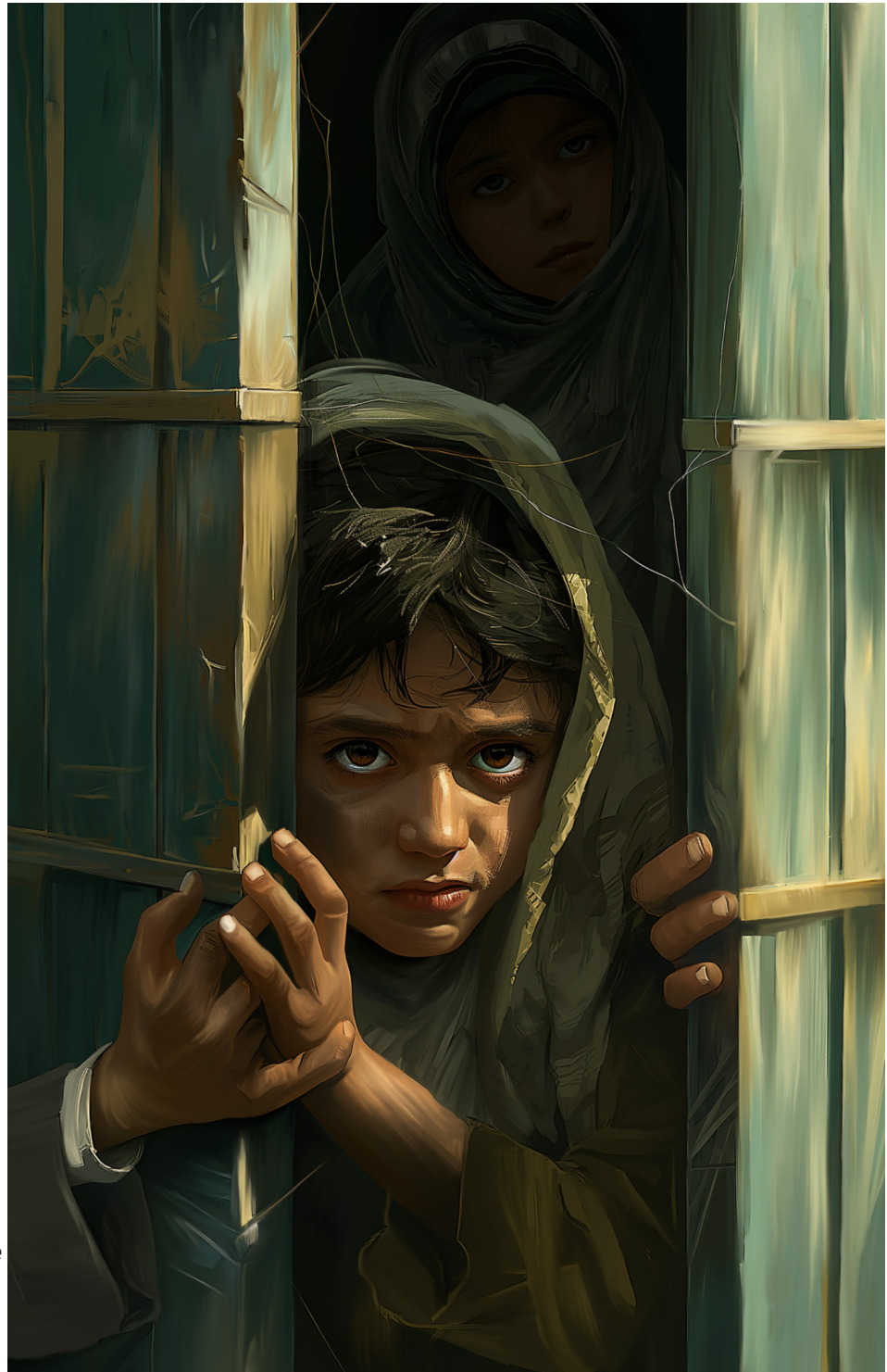
Windows of Lost Hope Size:a1 (594 x 841) Print on canvas

Each picture serves as a glimpse through a metaphorical window, where the window itself represents the profound pain of society. Through this lens, the focus is directed towards the lost childhoods of individuals, highlighting how this loss is intertwined with fear and a profound deficiency of peace. The images poignantly capture the emotional scars and the pervasive sense of insecurity that accompany such loss. They reflect the haunting impact of disrupted early years, illustrating how the absence of a secure and nurturing childhood can lead to enduring suffering and an ongoing search for solace. Through these visual windows, the artwork sheds light on the deep-seated trauma and the longing for tranquility that many carry with them throughout their lives.