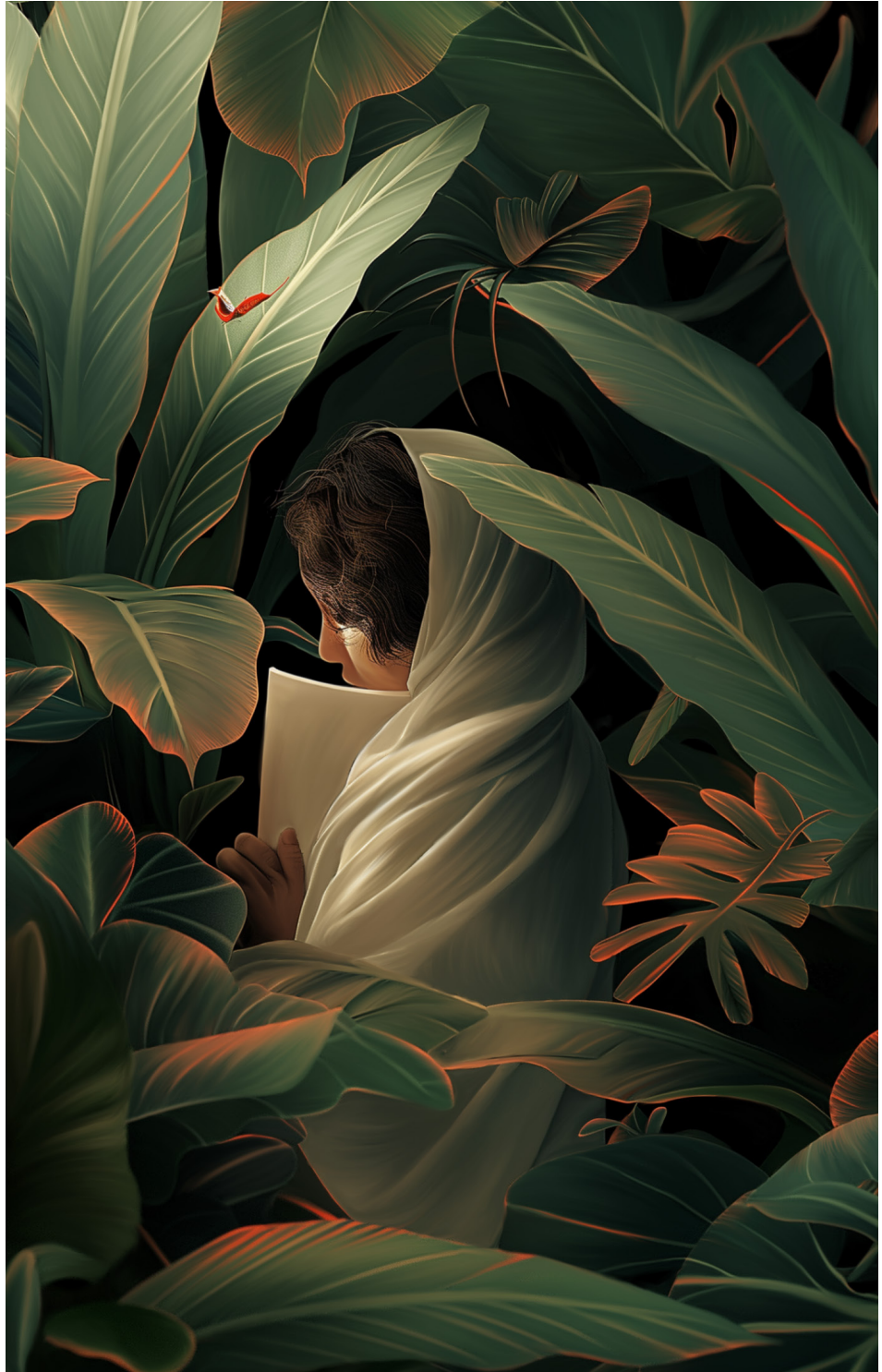
Displaced Shadows Size:a1 (594 x 841) Print on canvas

The artwork strongly captures the pervasive fear experienced by marginalized and impoverished communities, illustrating their deep sense of insecurity and alienation. Through evocative imagery and a poignant color palette, the piece conveys the anxiety and apprehension that arise from feeling out of place in the environments where they were born and raised. The artist's use of contrasting colors and unsettling compositions mirrors the emotional turbulence and existential dread faced by these communities, highlighting their struggle with a pervasive sense of not belonging. This visual representation underscores the broader theme of social displacement and the internal conflict stemming from being disconnected from one's own surroundings and identity.