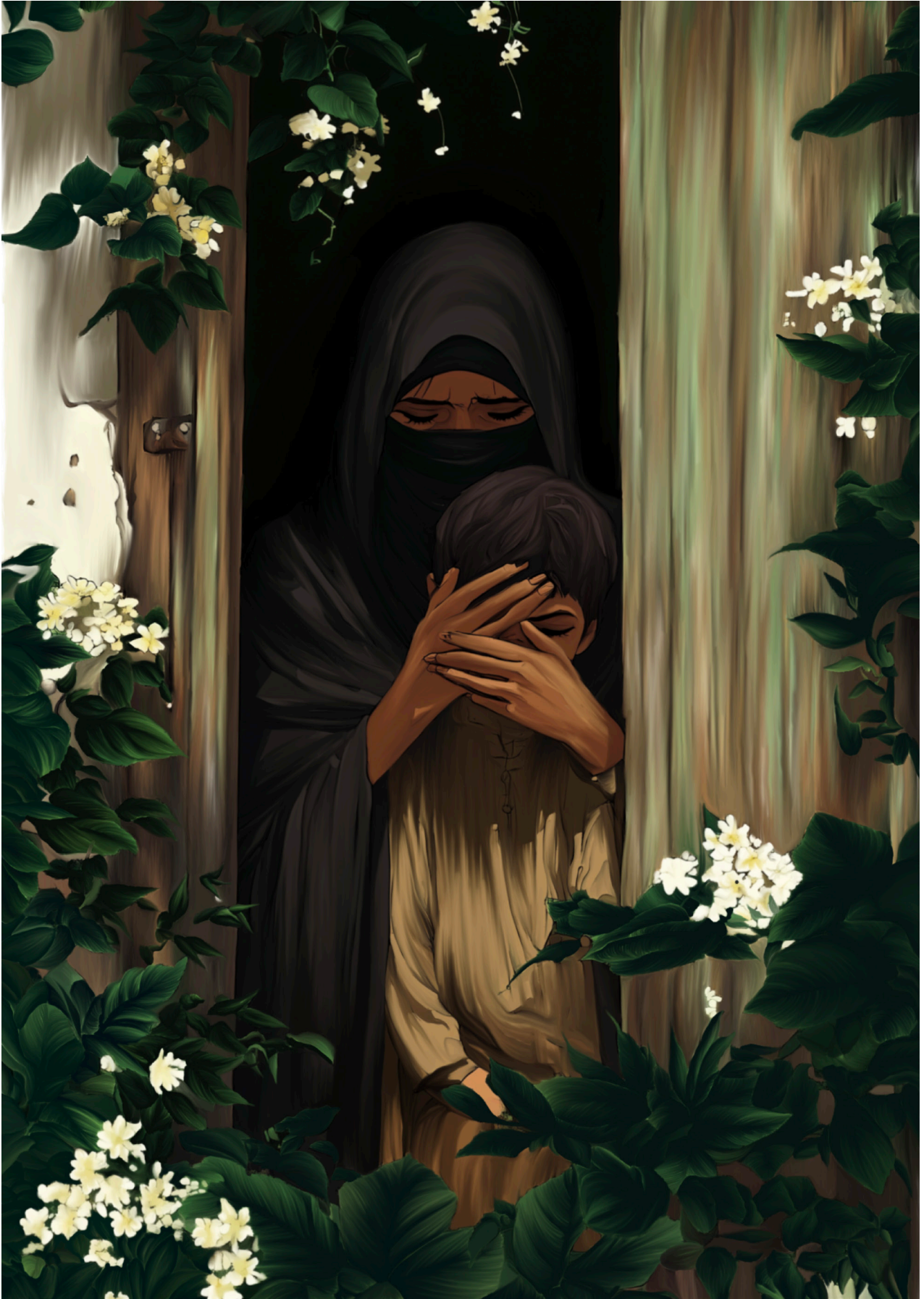
Windows of Lost Hope Size:a1 (594 x 841) Print on canvas