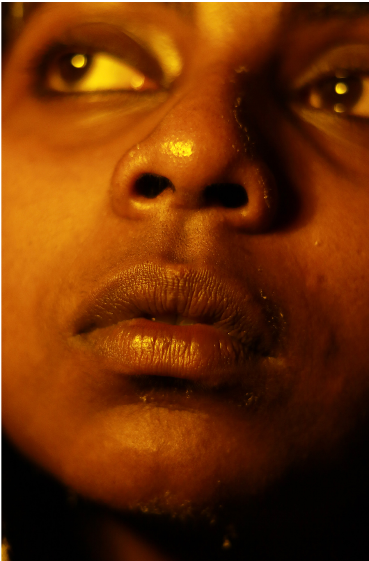
Size:a3 (297 x 420) Photograph