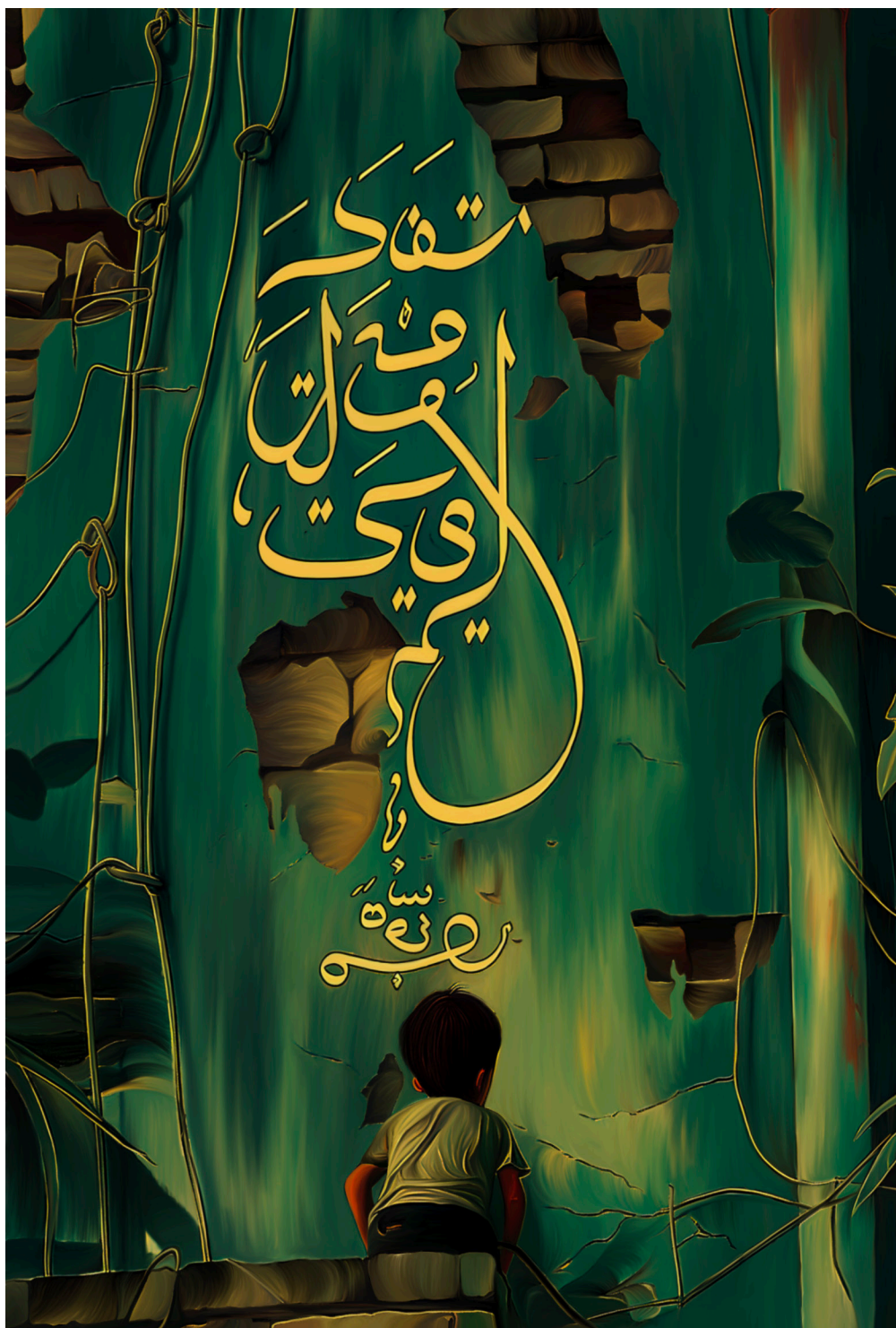
Echoes of Wisdom Size:a1 (594 x 841) Print on canvas

The calligraphic depiction of the word "Iqrah," which means "read," is deeply inspired by the Malayalam proverb, "Vaayichalum varalum, vaayichillelum varalum, vaayichu valarnnal vilayum vaayikkathe vararnnal vayalayum." This proverb underscores the transformative power of reading, emphasizing that engagement with knowledge can lead to growth and prosperity, while neglecting it can result in stagnation. The artwork vividly conveys this message by urging viewers to embrace reading and intellectual exploration. The word "Iqrah" serves as a poignant reminder of the value of learning and its potential to bring about positive change in both personal lives and communities. It encourages a deeper appreciation for education and its role in fostering development