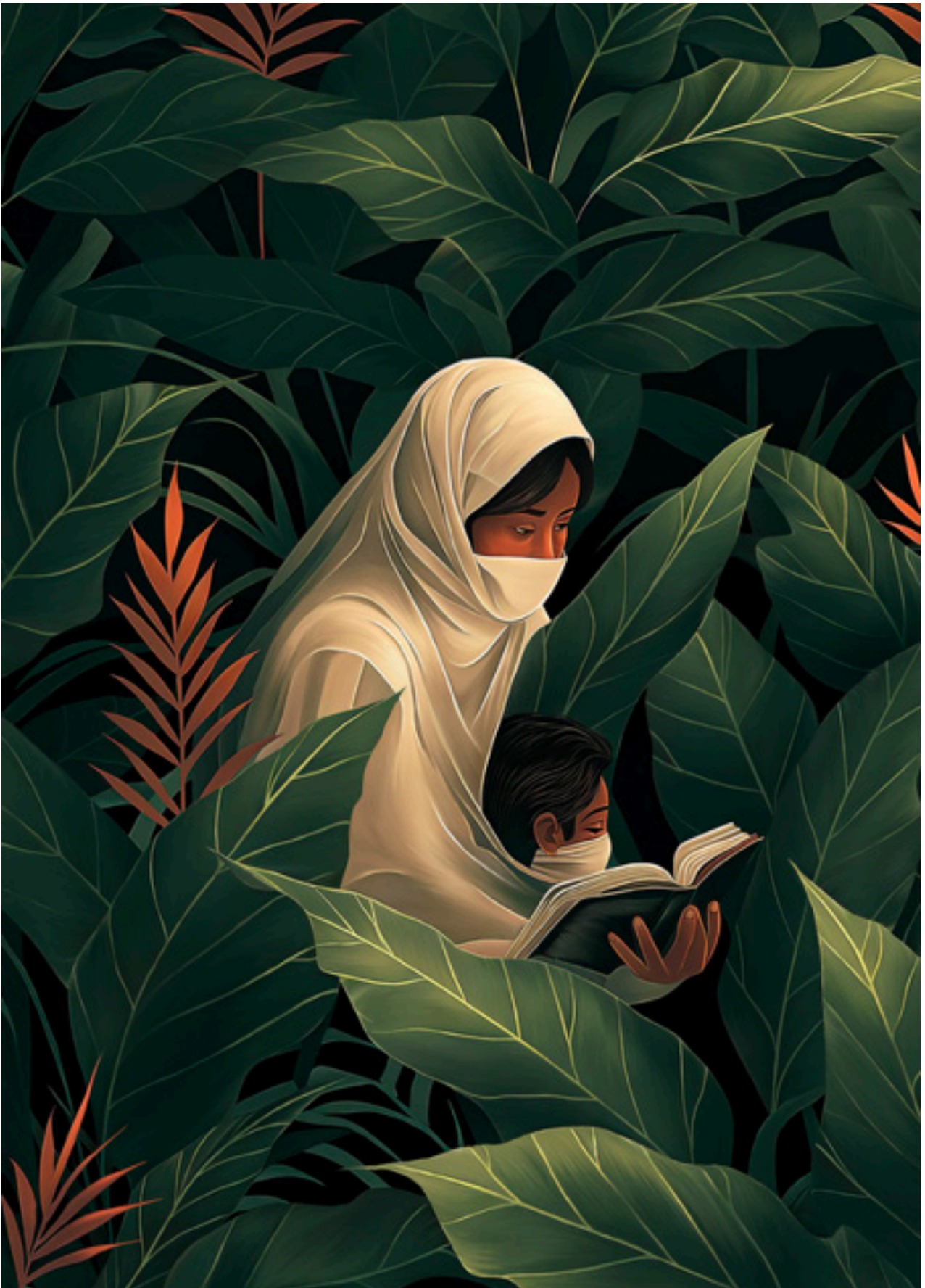
Displaced Shadows Size:a1 (594 x 841) Print on canvas