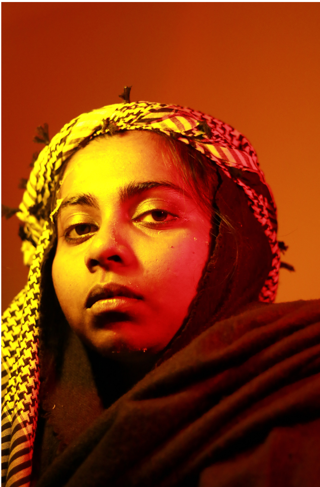
Size:a3 (297 x 420) Photograph