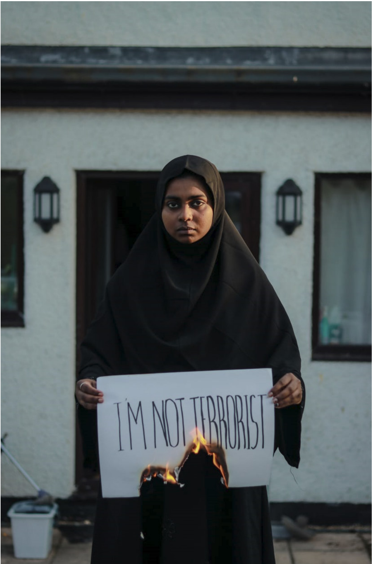
Size:a3 (297 x 420) Photograph