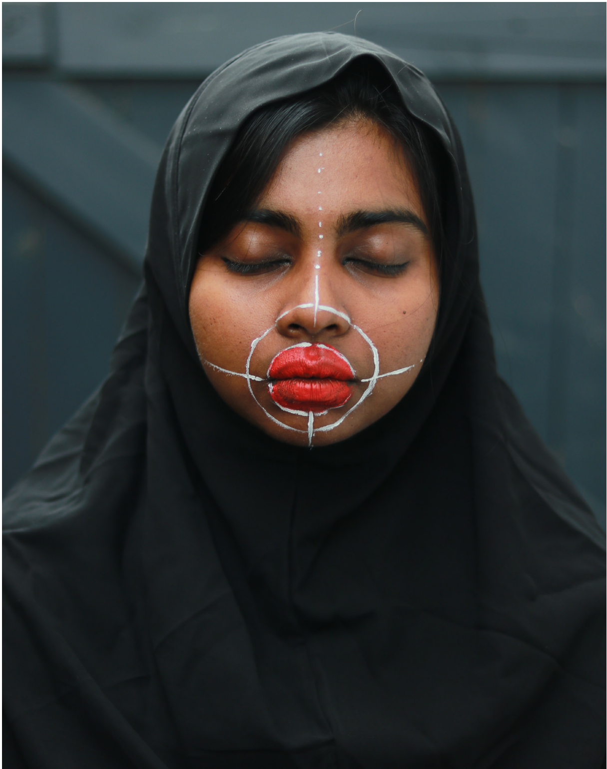
Size:a3 (297 x 420) Photograph

Silence often serves as a subtle yet powerful force, embodying both the quiet strength and the muted voices of its people. Under a dictatorship, this silence becomes even more pronounced, as fear and repression suppress open expression. Pictures that capture this silence might depict empty streets, subdued daily activities, or tranquil landscapes, emphasizing how the oppressive atmosphere stifles the community's voice. These images, while appearing peaceful, poignantly reveal the underlying constraints imposed by authoritarian rule. They serve as a stark reminder that beneath the calm exterior lies a profound struggle, with the silence echoing the lack of freedom and the suppressed cries for change.