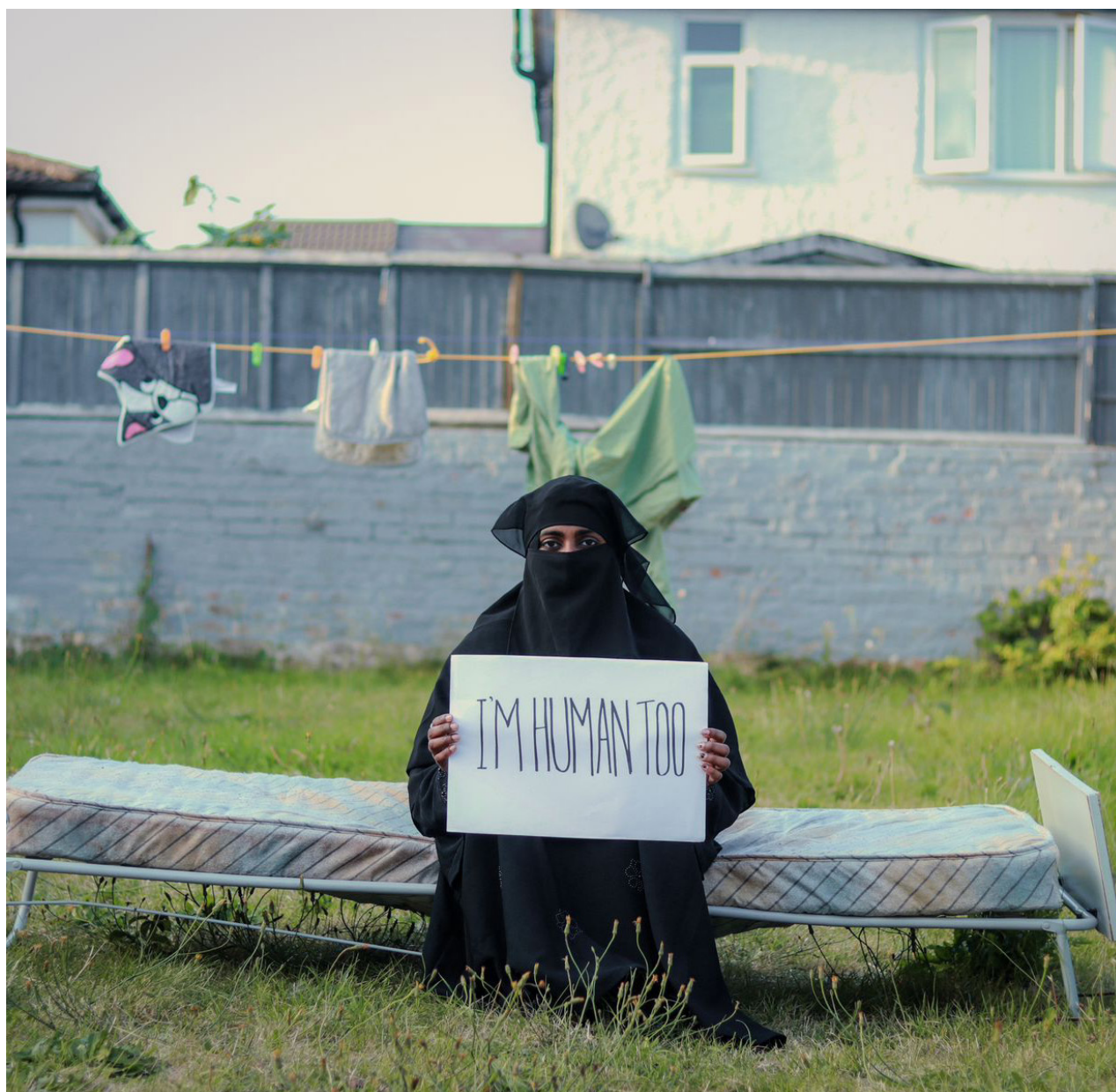
Size:a3 (297 x 420) Photograph

The picture powerfully illustrates the significance of human rights and equal treatment for all, highlighting that every person deserves respect and fairness, regardless of their identity. By portraying diverse individuals coming together, it emphasizes the fundamental need for equality and the equal opportunities everyone should have. The image also reflects the struggles of finding a sense of belonging, capturing the deep emotional toll of exclusion and disparity. Amid these challenges, it conveys the last hope of individuals who yearn for acceptance and inclusion. This visual reminder of our shared humanity urges us to stand up for one another's rights and work towards a world where every person feels valued and has a place to belong.