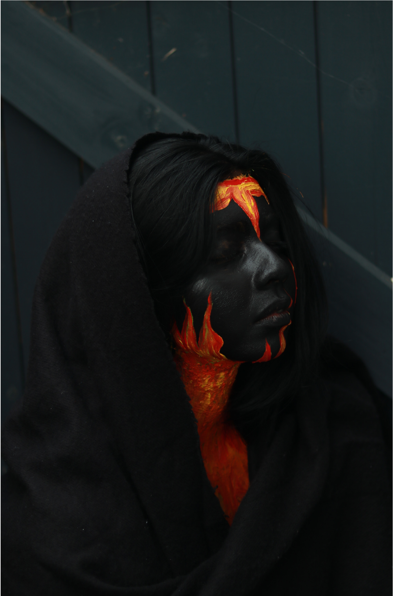
Size:a3 (297 x 420) Photograph