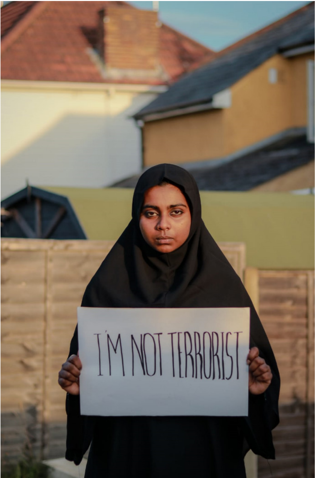
Size:a3 (297 x 420) Photograph