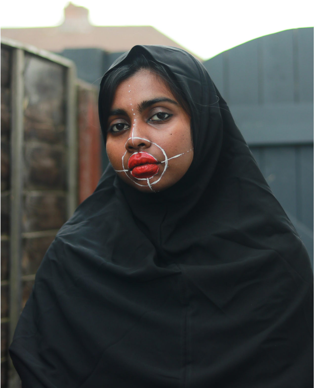
Size:a3 (297 x 420) Photograph