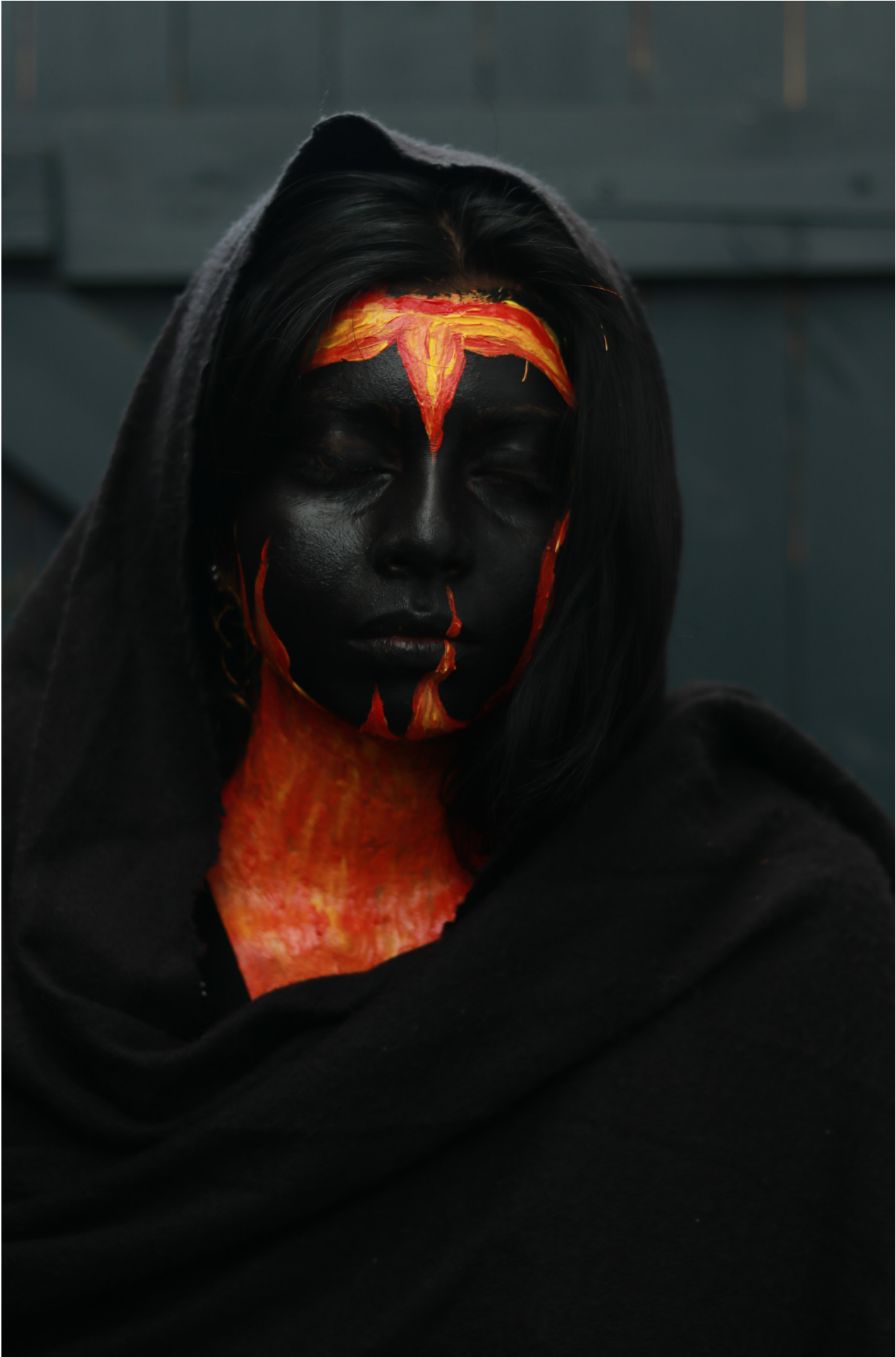
Size:a3 (297 x 420) Photograph