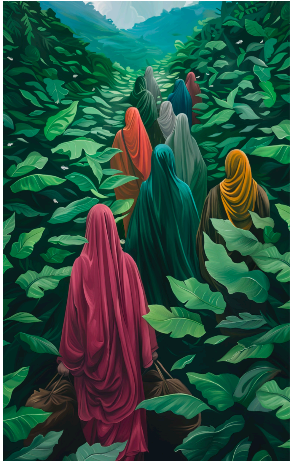
Beyond the Void Size:a1 (594 x 841) Print on canvas

The picture tries to capture the harsh realities of life through its use of color and detail. The artwork conveys the profound struggle of individuals who, despite their efforts, find themselves empty-handed and seeking peace. The stark, somber hues and meticulous details reflect their feelings of loss and despair, illustrating the emptiness that comes from having once possessed everything but now finding themselves with nothing. The painting evokes a deep emotional response, emphasizing the vulnerability and longing of those caught in a cycle of searching for solace amidst their disillusionment.