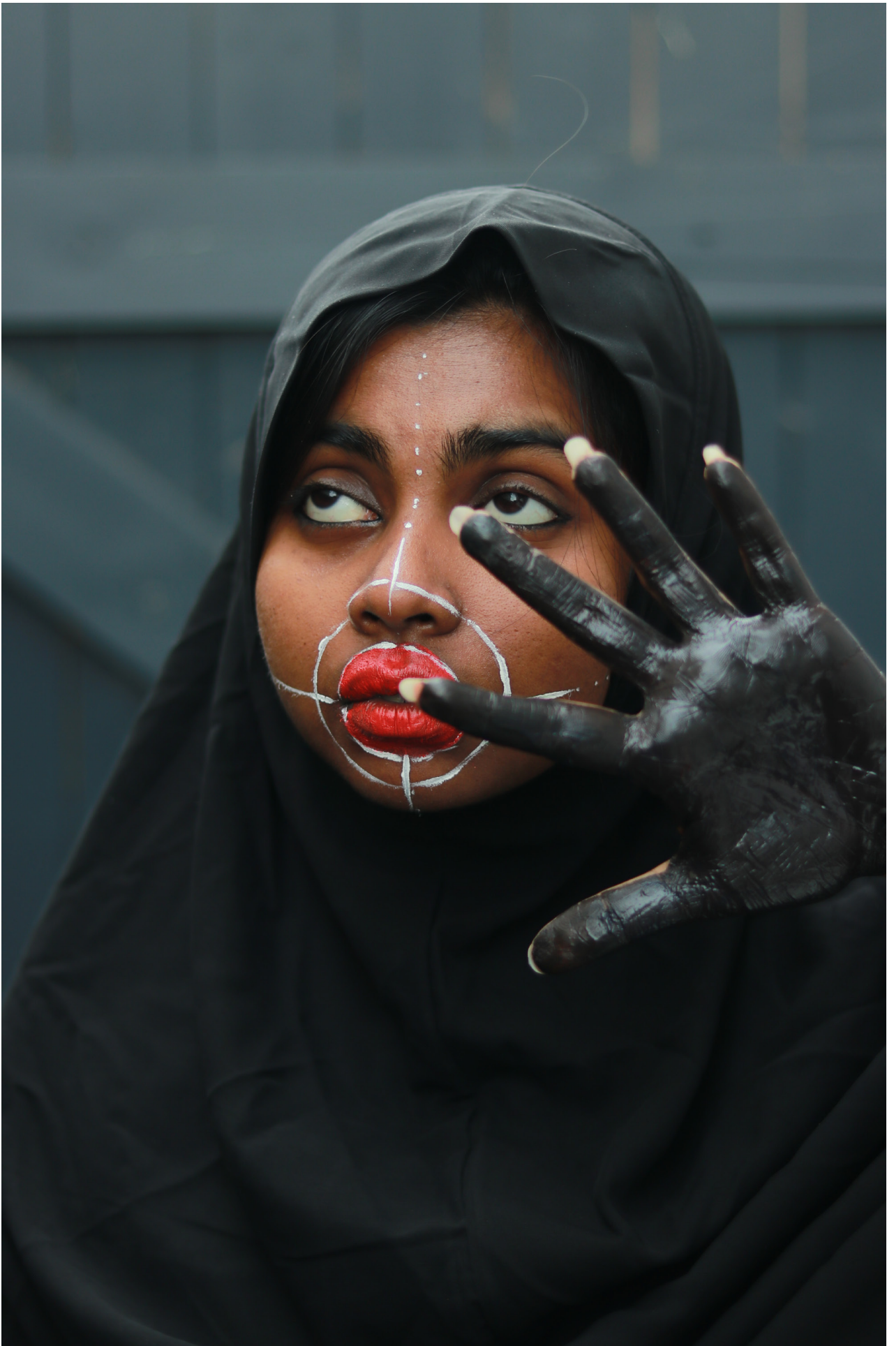
Size:a3 (297 x 420) Photograph