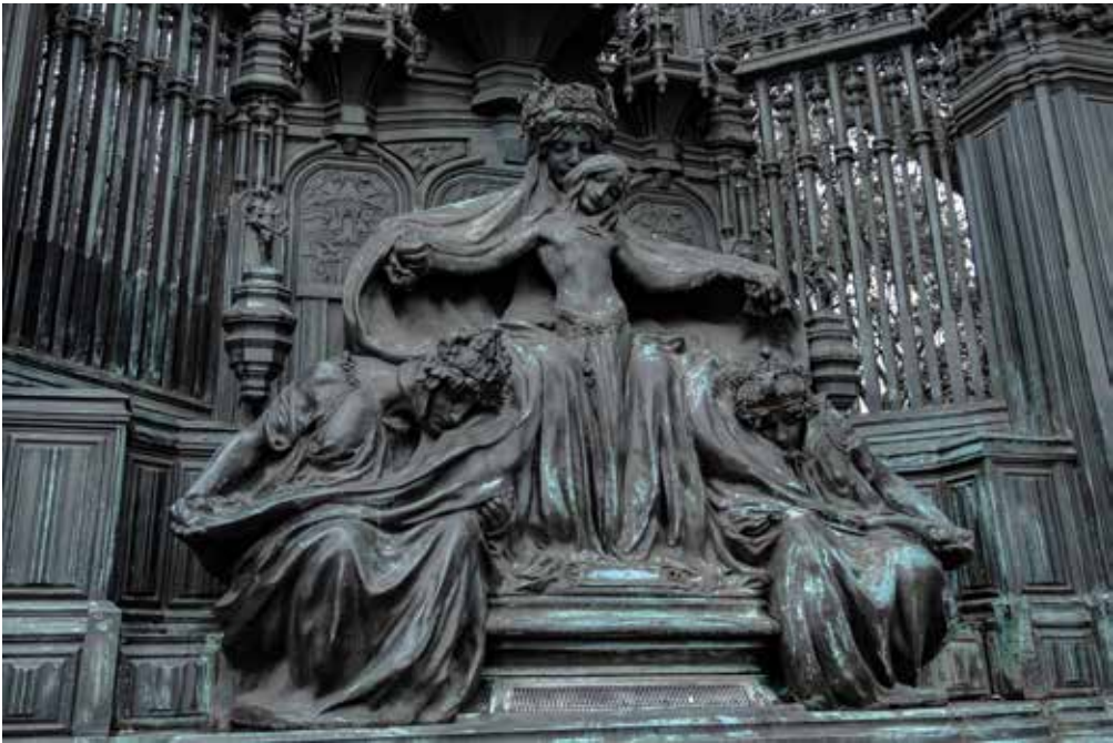
01. Statuary mark Statues that were built at a very early time have also been attached with distinctive traces through the evolution of different times