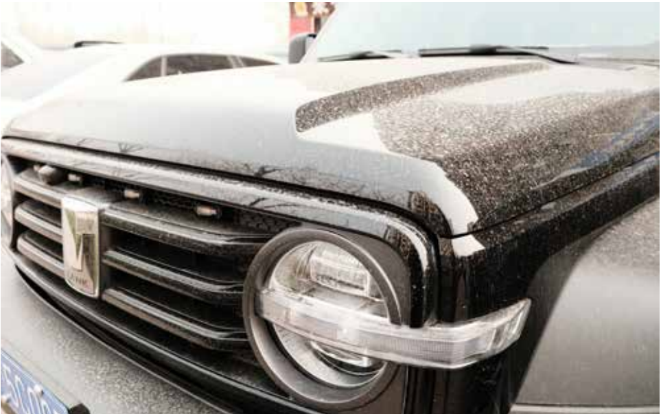
o0. dust The presence of a lot of dust indicates that the vehicle has traveled far from the city