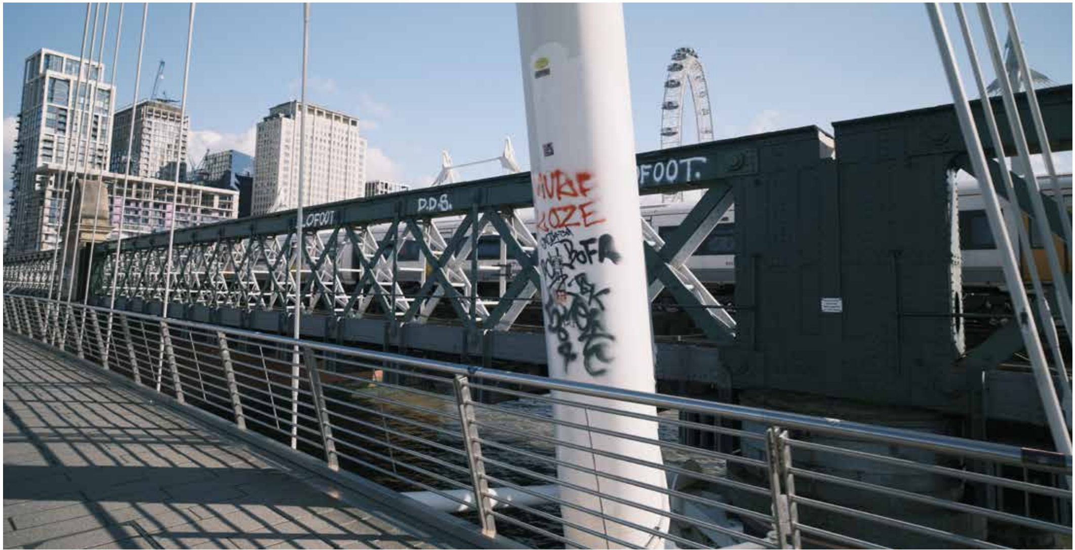
o0. Street graffiti This graffiti is always seen on joints in London, reflecting not only the various strange places that taggers can climb, but also the traces that humans have left on buildings