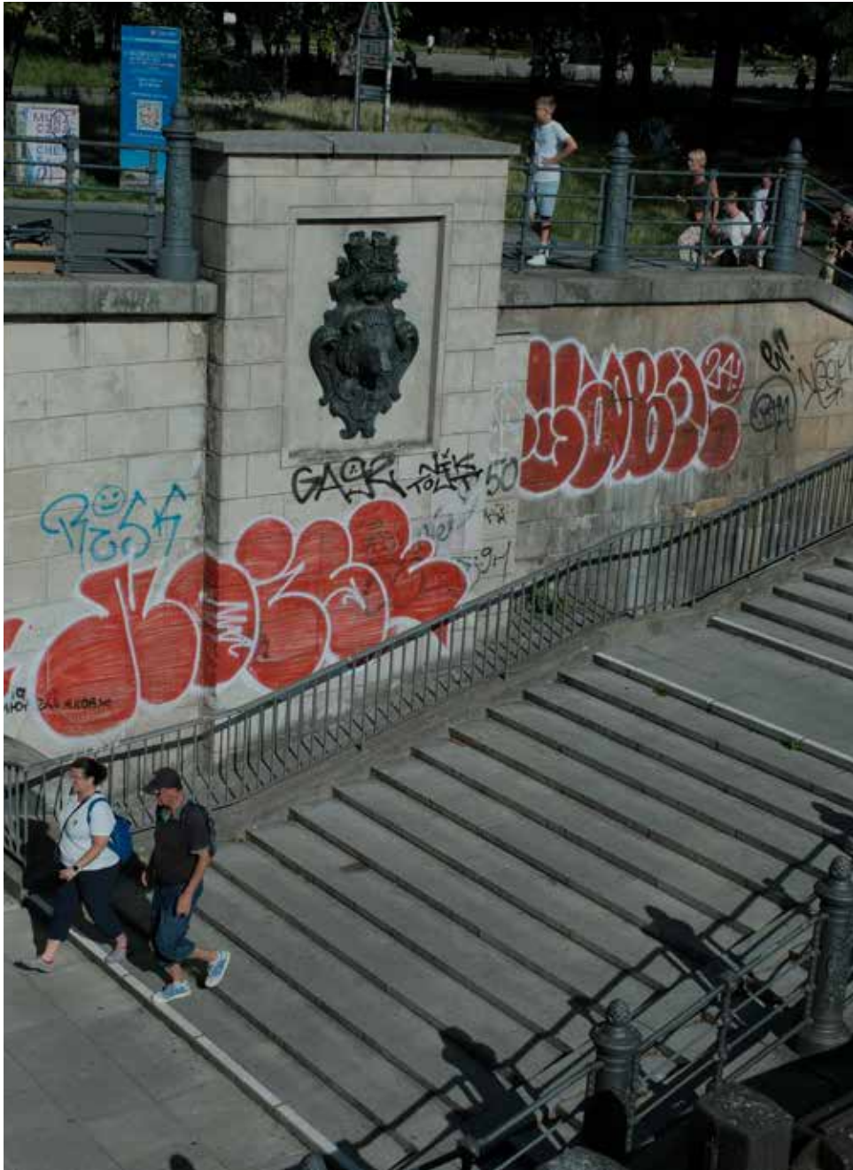
o1. Street graffiti