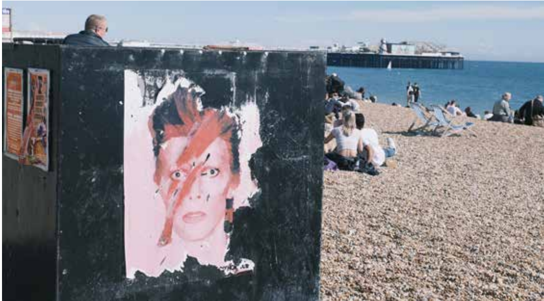
oo. mottled poster Street markings are not unique to graffiti artists