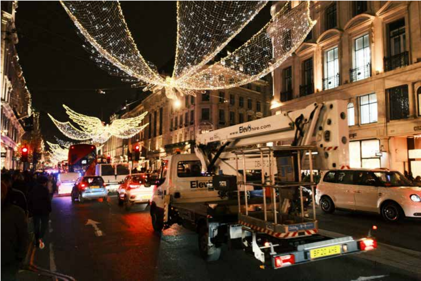
01. street Even on the streets, it is not difficult to find some traces left by humans.