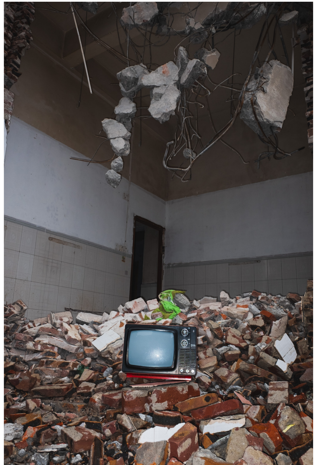
The television was conspicuous among the ruins, but in another way it was inconspicuous