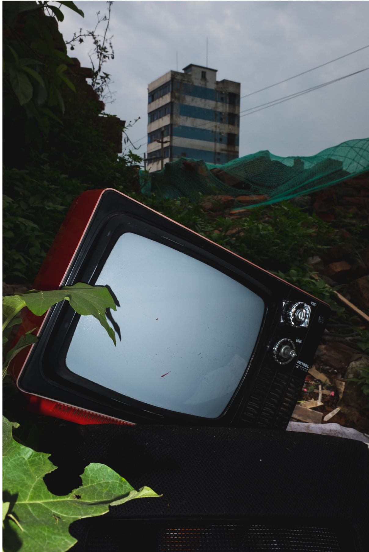
The TV in the trash